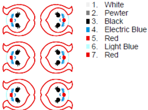
Sallyhead 50mm Sorted 5x7.pes 108.80x166.80 mm; 8,348 stitches 7 thread changes; 6 colors