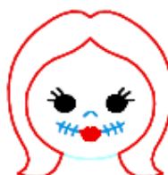
Sallyhead 50mm.pes 49.20x50.00 mm; 1,391 stitches 7 thread changes; 6 colors